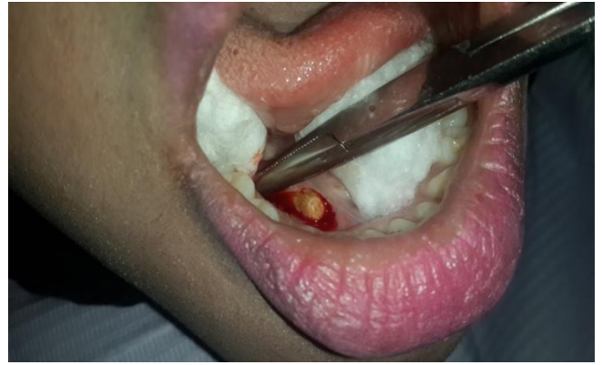
Figure 4: Actual of the stone (4 inches)