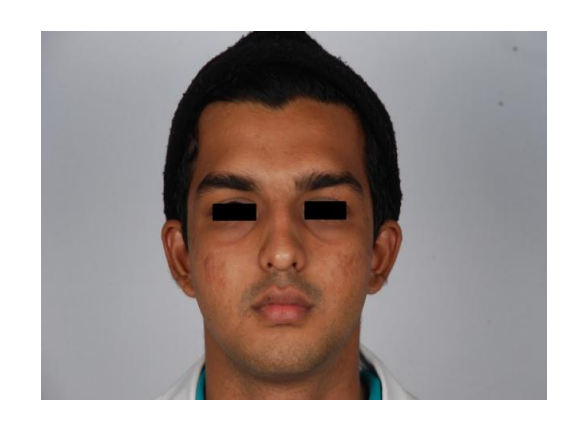
Leptoprosopic Gujarati Male