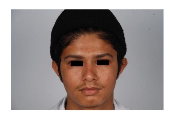
Euriprosopic Gujarati Male