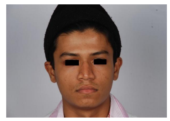
Hypereuriproscopic Gujarati Male